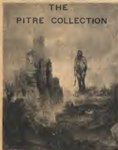
THE PITRE COLLECTION